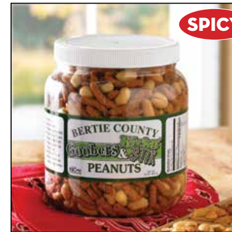
F. Goobers & Kickn’ Stix