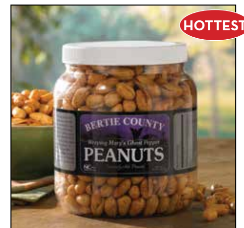
L. Weeping Mary’s Ghost Pepper Peanuts