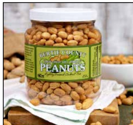
M. Dill Pickle