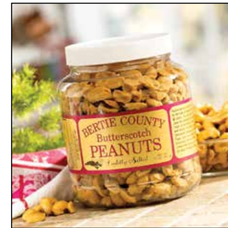
G. Butterscotch Peanuts