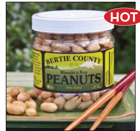
D. Wasabi & Soy Peanuts