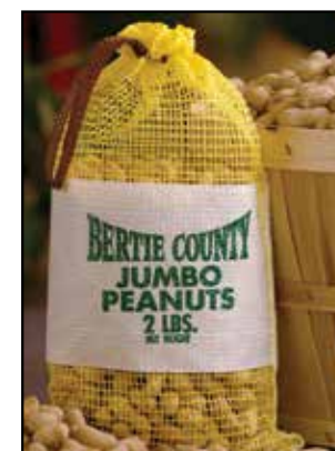
N. Raw In-Shell Peanuts