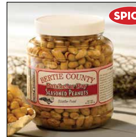
C. Batchelor Bay Seasoned Peanuts