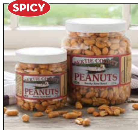
I. Smoky San Souci