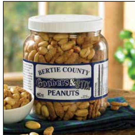
E. Goobers & Stix