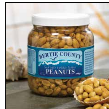
K. Sea Salt & Black Pepper Peanuts