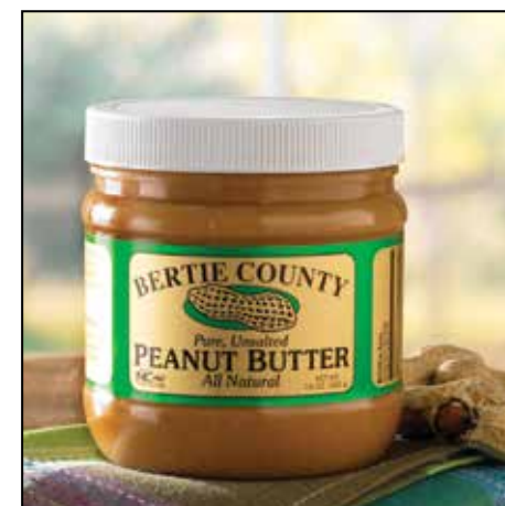
J. Peanut Butter