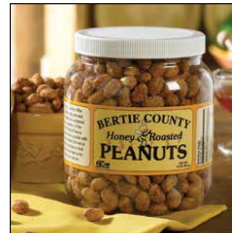
B. Honey Roasted Peanuts