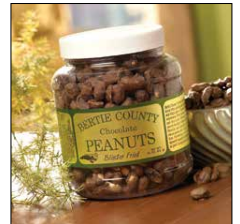
H. Chocolate Peanuts