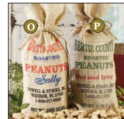
O. Roasted Salted In Shell Peanuts